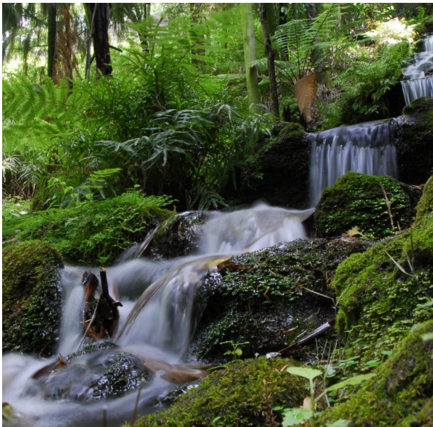
Power and Gentleness

Survivors of sexual abuse become protectors of children. Only a very small percentage of victims of sexual abuse become perpetrators.